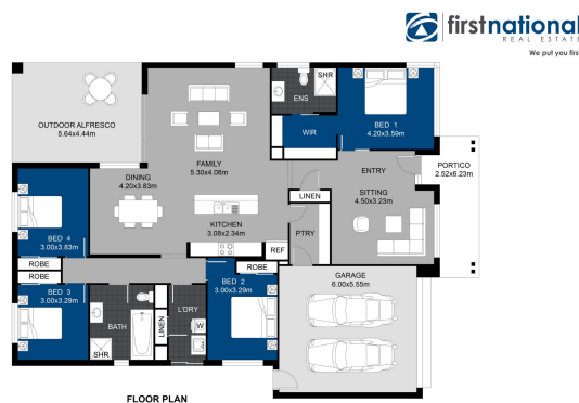
This floor plan including furniture, fixture measurements and dimensions are approximate and for illustrative purposes only. Realistic color guide is provided, whereby it represents as to the quantity and layout. All enquiries must be directed to the agent, vendor or party representing the floor plan. 30 Lawson Drive, Lakes Entrance